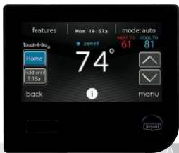
Evolution™ Connex™ Control SYSTXBBECC01-B