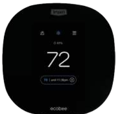
ecobee for Bryant ecobee3 lite EB-STATE3LTIBR-01