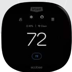
ecobee for Bryant Smart Thermostat Premium EB-STATE6IBR-01