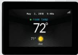
Evolution™ Connex™ System Control SYSTXBBECC01-C